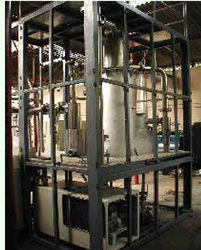
The gasification system tested at IPT.

FINEP / BUN / CENBIO / IPT / UFAM / INCRA