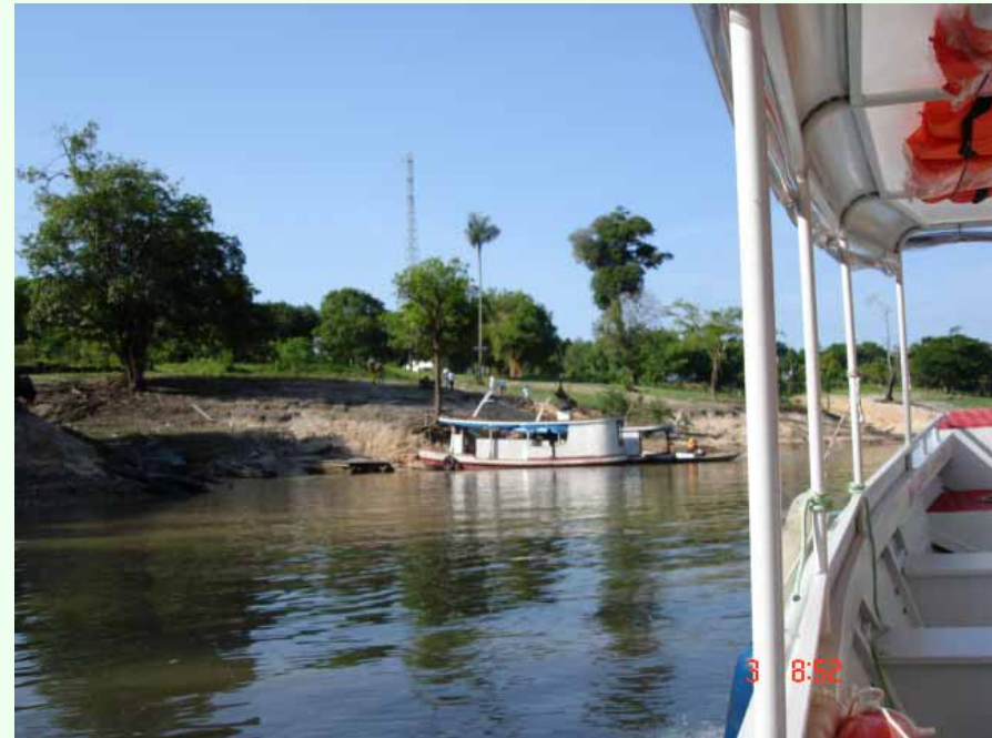
Isolated Village at Amazon State.