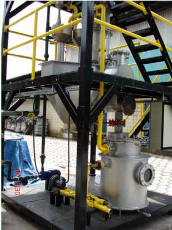
Pictures of the gasification system constructed for GASEIBRAS Project - IPT